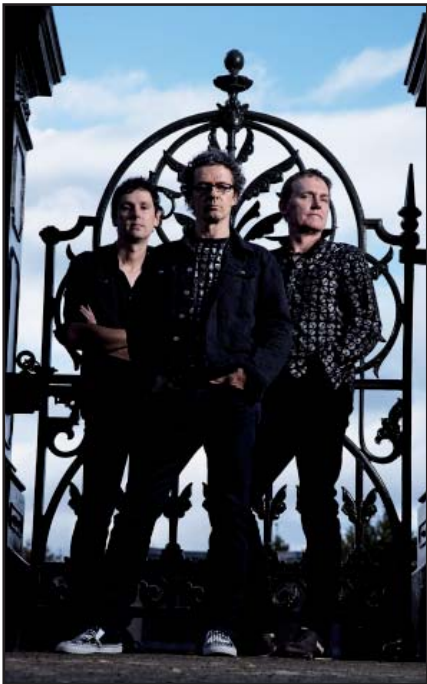
The Choirboys will rock the MEC for IESA's anniversary

In March 2009, IESA will turn 15 years old. To celebrate, IESA is hosting an exclusive charity dinner at the Mackay Entertainment Centre. The special evening will raise money for CQ Rescue, a life-saving service close to the heart of the Mackay community.